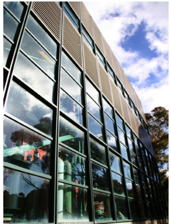
UC San Diego Central Plant