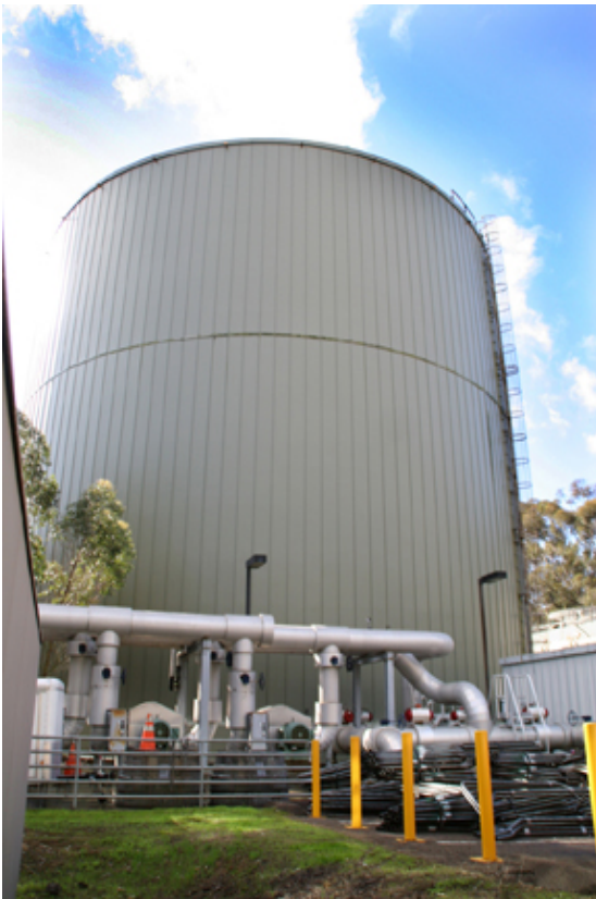
Cold Water Storage Tank

The SoLoNOx™ is called a “dry low emissions” system because it does not require water or steam injection. It makes use of a non-ammonia, passive catalyst that gets released as inert nitrogen gas. The process uses lean, pre-mixed combustion technology and a uniform air/fuel mixture to carefully control the combustion process. Solar Turbines estimates that SoLoNOx™ has saved over 1.2 million tons of NOx emissions to date.